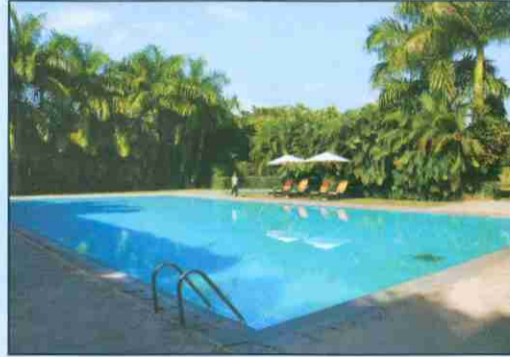
The olympic-size swimming pool at Sinclairs