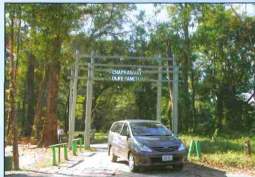
The entrance to Chapramari Wildlife Sanctuary

The fairytale setting of Suntalekhola in a loving embrace of a gurgling brook and surrounded on all sides by towering mountains is a truly a unique experience. The orange laden trees, the gentle gurgle of flowing water, the rustling of dry conifer leaves as you step on them will surely charm you. The slanting rays of the sun render the whole setting truly magical. Suntalekhola's calm and unassuming beauty will leave visitors mesmerised.