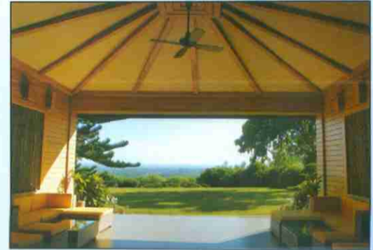
A view of the valley as seen from Sinclairs