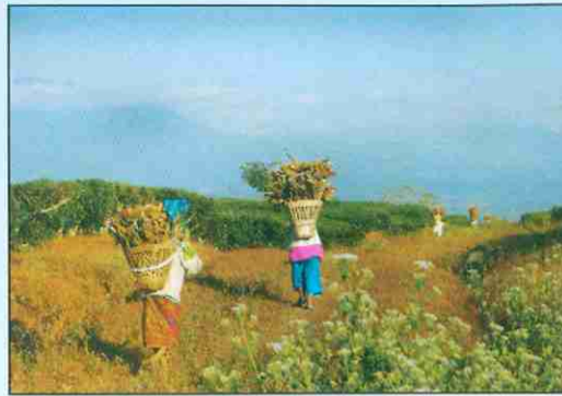
Locals returning with wood