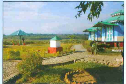
The cottage inside Chapramari forest