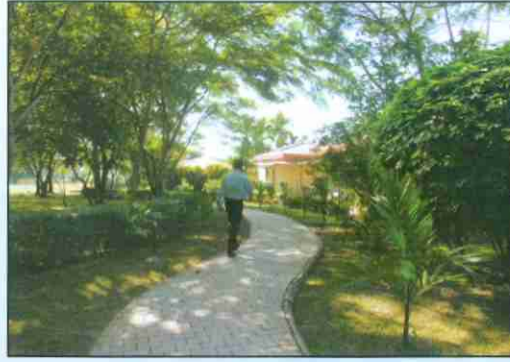
The path way leading to the cottages at Sinclairs