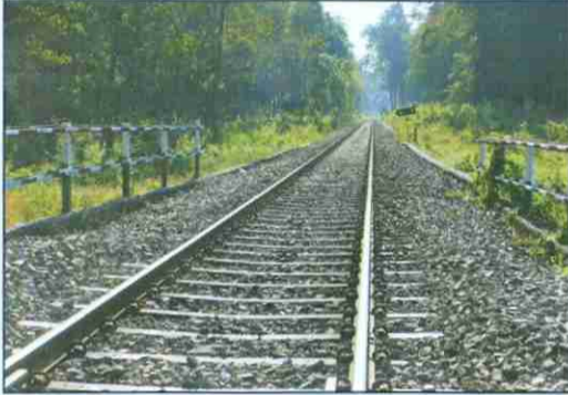
The railway track which passes through Dooars