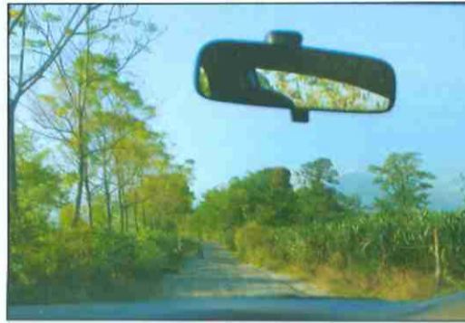
On the way to Samsing