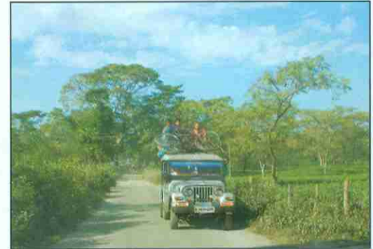
The local transport at Chalsa