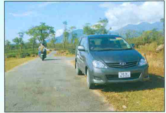
On the way to Chalsa