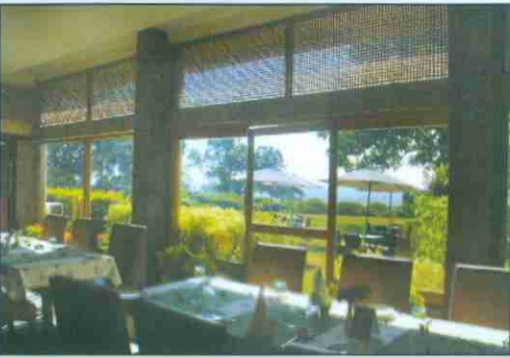
The restaurant at Sinclairs over looking the valley