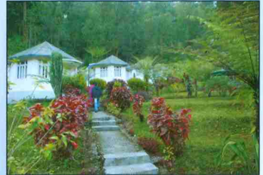
WBFDC cottages at Suntalekhola