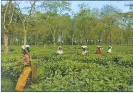
Women working in the tea garden