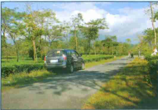
Passing through the tea gardens at Chalsa