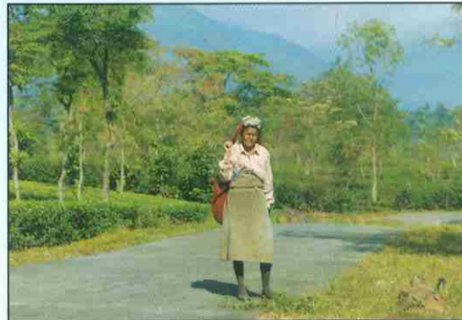
A tea plucker returning from work