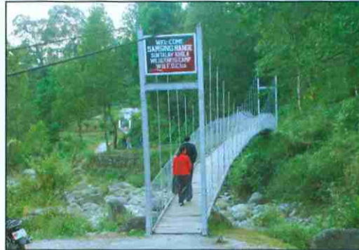
The hanging bridge at Suntalekhola

Dotted with orange orchards and cardamom plantations, Samsing and Suntalekhola, both are situated close to each other. These are unspoilt mountain destinations growing in popularity among tourists. The serpentine road leading to Samsing offers a glimpse of the lush green Dooars and a bird's eye view of the Murti River which looks like a satin ribbon from above. Samsing is also the gateway to Neora Valley National Park. The park is a haven for birdwatchers. One can get stunning views of Kanchenjunga by trekking up to Rachel Pass, a popular point for adventure seekers and adrenalin charged tourists.