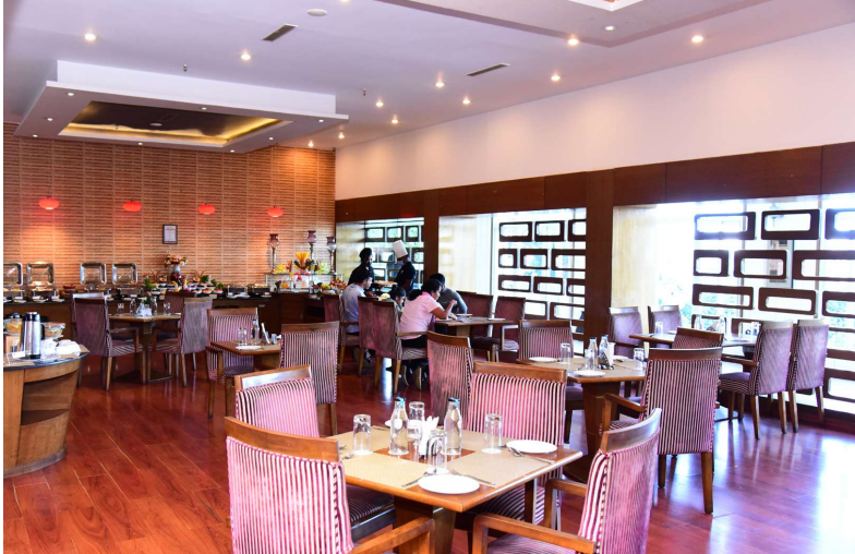
Pine n Petals Restaurant