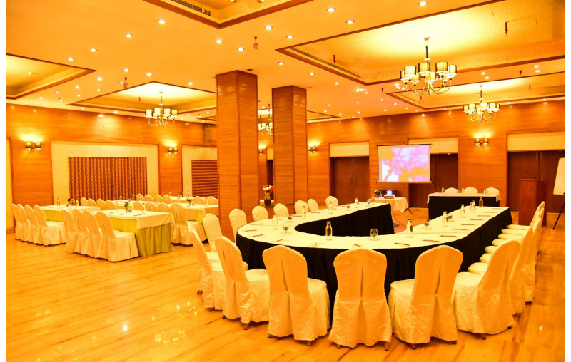
The Regal Room