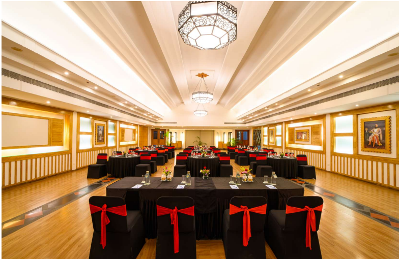
The Darbar Hall