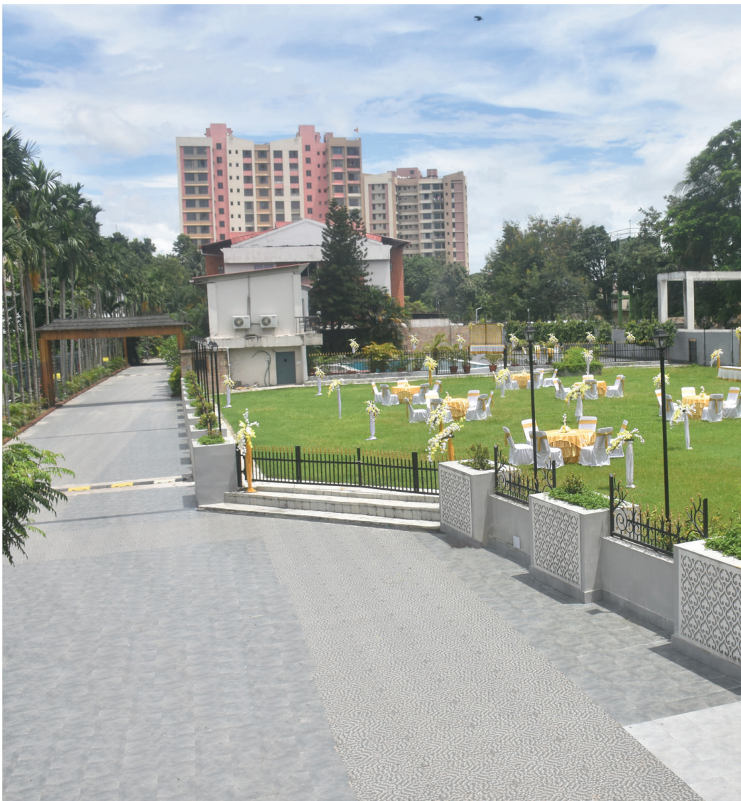
Entrance to the hotel