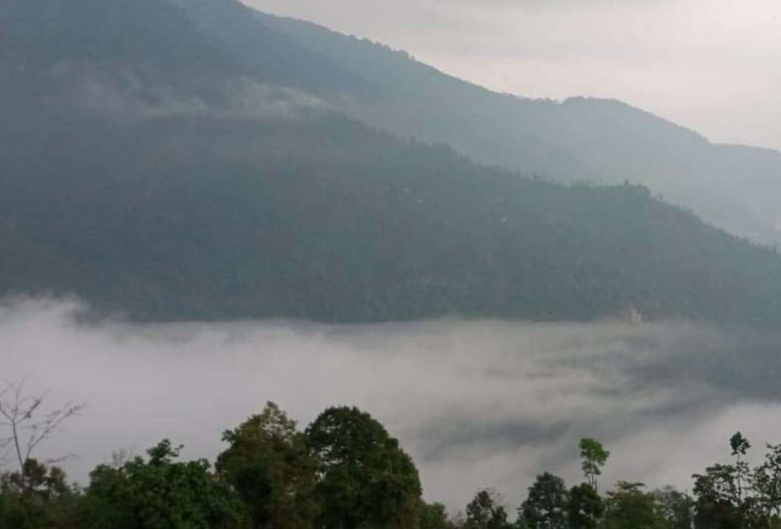
Breathtaking view of the mountains from the hotel