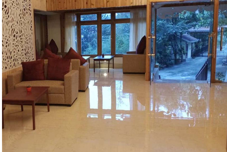
A cosy lobby