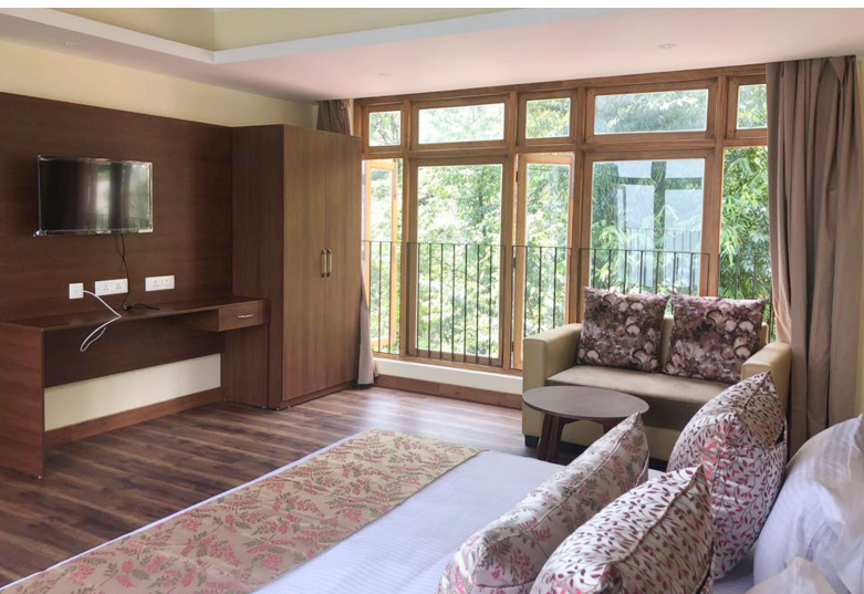
Suite's spacious bedroom