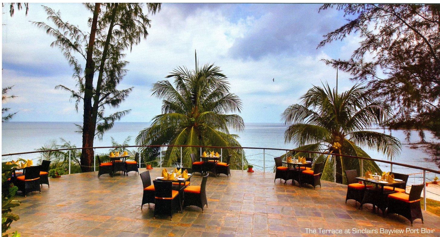
The Terrace at Sinclairs Bayview Port Blair