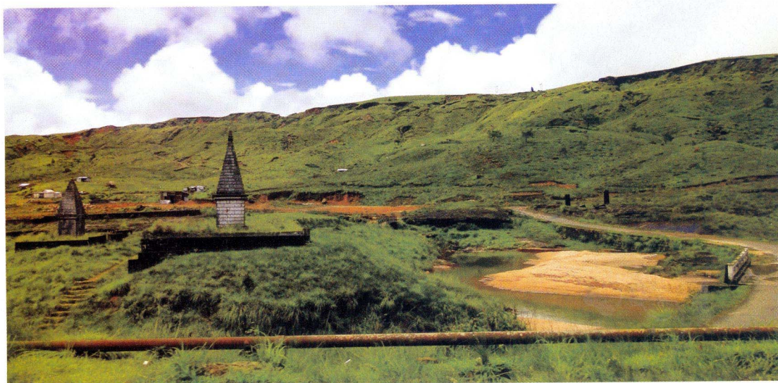
Clockwise from left: Lush landscape of Cherrapunji; One-horned rhinos in Jaldapara Wildlife Sanctuary; A bison in Amba

SpiceJet flies to Pune, Bagdogra and Mumbai See schedule, page 182.