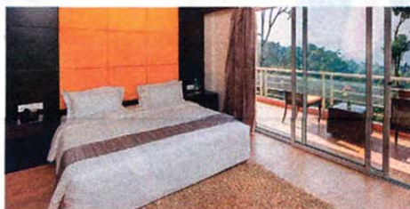
There are many paths to meander in and around the sprawling five-acre Sinclairs Retreat in Kalimpong

The resort has 48 rooms, out of which 28 are premier rooms, 16 with an attic (four beds), two suites and two rooms in a unique wooden cottage. Room rates start at Rs 5,500 (plus taxes).