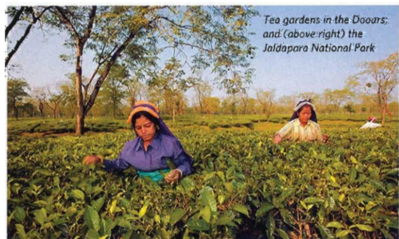
Tea gardens in the Dooars; and (above right) the Jaldapara National Park

Tucked between the Himalyan wilderness and the woods of the Northeast, the Dooars have always offered a cogent argument for leisurely escapes—preferably, on elephant back. But while only the most intrepid travellers ventured into Jaldapara's beautiful jungles earlier—threatened not by wild animals, but by the state of the government-run lodges here—the tourist in 2013 is spoiled for choice. Among the best-known properties in the area—near the national parks of Gorumara and Jaldapara—are Sinclairs Retreat Dooars, perched on the Chalsa hilltop (about ₹7,000 with taxes for